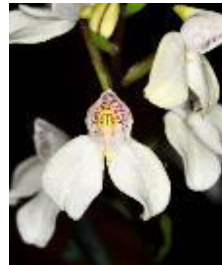
Disa unknown (3 plants)