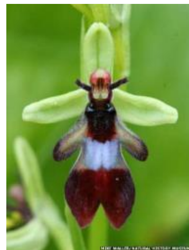
Blooms like the fly orchid are charismatic, much-loved plants - but some orchid species are

Studying the timing of seasonal events like flowers blooming or frogs spawning - a field called phenology - offers insights into how the living world is affected by environmental change. It also helps scientists try to predict the results of continued change.