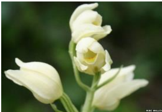
Some rare orchids like the white helleborine have been spotted in previously unknown locations