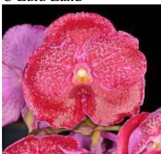
V Kathleen Ngo (= Sarapee Blue x Doctor Anek)

Phal japonica C Milpurat (= milleri x purpurata) V Princess Mikasa 'Pink' Sarco Coral Ice (ceciliae x Melba) Sarco Kathy V Freckled Beauty (= Butterfly x Srakaew)