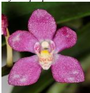
Sarco Elise x Nicky

Den Paradise Elizabeth Sarco coccinea alba?? (Sophronitis or ceciliae?) Sarco Lois Bif atropurpurea