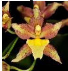
Onc Daphne ‘Awahuri’

Phal cornu-cervi ‘Red Wan Chiao’ Ctt Seagulls Adam Michael