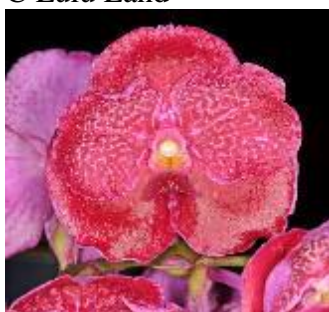
V Kathleen Ngo (= Sarapee Blue x Doctor Anek)

Phal japonica C Milpurat (= milleri x purpurata) V Princess Mikasa 'Pink' Sarco Coral Ice (ceciliae x Melba) Sarco Kathy V Freckled Beauty (= Butterfly x Srakaew)