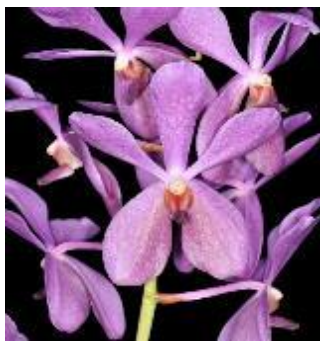
Aranda Noorah Alsagoff