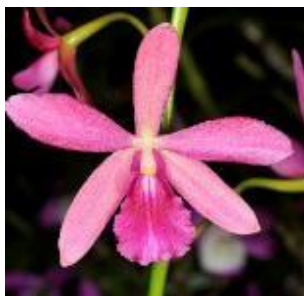
Cty Summer Sangria (syn Stanfieldara or Sfdra)