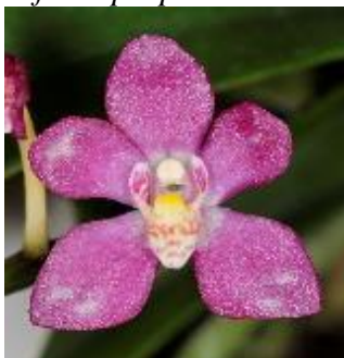
Sarco Elise x Nicky

Den Paradise Elizabeth Sarco coccinea alba?? (Sophronitis or ceciliae?) Sarco Lois Bif atropurpurea