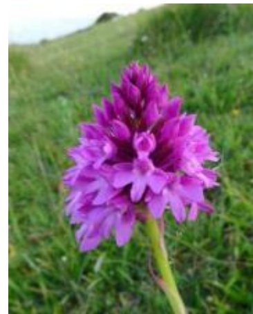
Members of the public can upload their own photos to be identified