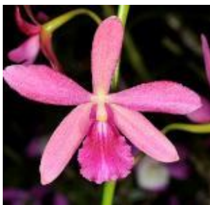
Cty Summer Sangria (syn Stanfieldara or Sfdra)