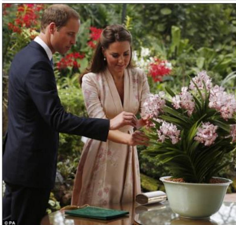
Finishing touch: The couple add the official name tag to the orchid