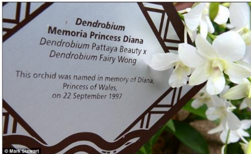
Touching tribute: The Duke and Duchess of Cambridge viewed the Dendrobium Memoria Princess Diana Orchid when they visited the Singapore Botanic Gardens