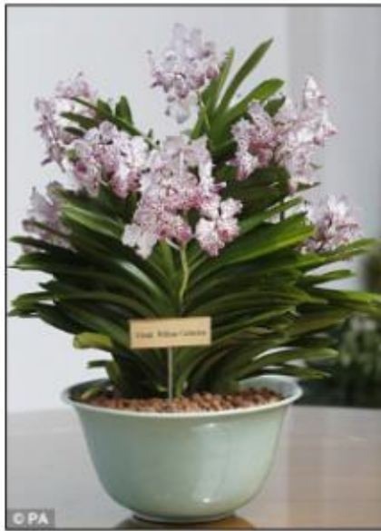
The Vanda William Catherine: The free-flowering orchid hybrid is meant to represent the marriage of Prince William and Kate Middleton